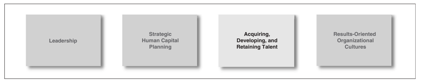
Figure 1: Cornerstones of GAO's Model of Strategic Human Capital Management

Strategic human capital management centers on viewing people as assets whose value to an organization can be enhanced through investment. Like many organizations, federal agencies are trying to determine how best to manage their human capital in the face of significant and ongoing change. GAO's model of strategic human capital management<sup>1</sup> identified four cornerstones of serious change management initiatives. These cornerstones represent strategic human capital management challenges that, if not addressed, can undermine agency effectiveness. One of these challenges is for the federal government to successfully acquire, develop, and retain talent. (See fig. 1.) Investing in and enhancing the value of employees through training and development is a crucial part of addressing this challenge.