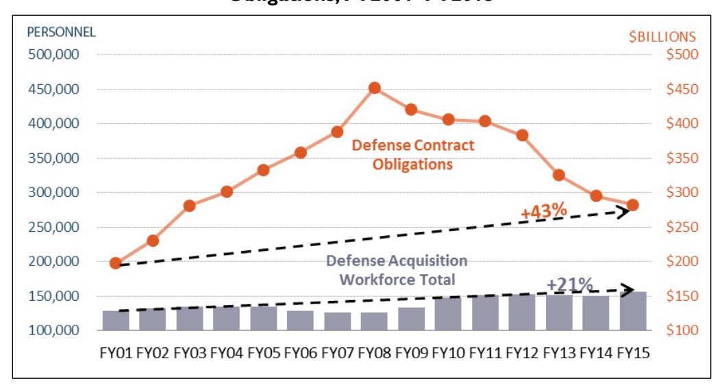
Figure 3. Comparison of Acquisition Workforce Size and Defense Contract Obligations, FY2001-FY2015