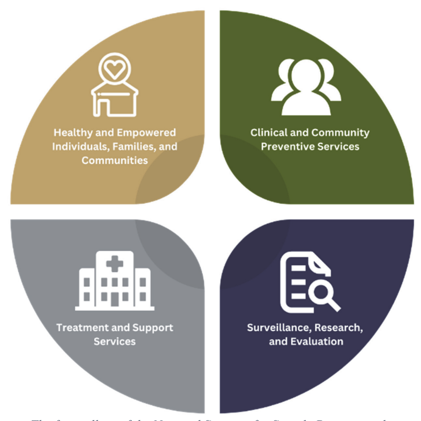
Figure 1.2 The four pillars of the National Strategy for Suicide Prevention that serve as the foundation for the SPRIRC's recommendations