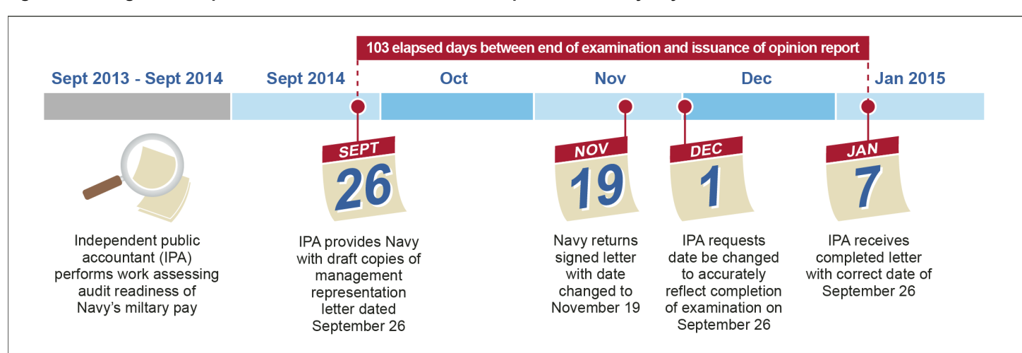
Figure 3: Management Representation Letter Timeline for the April 2013 Military Payroll Examination